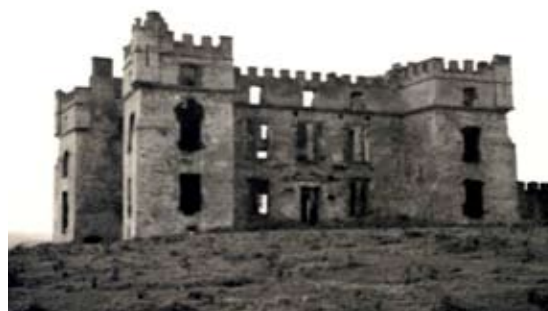
Bishops Palace, Raphoe

Some of the arriving Scots had neither English nor Gaelic and spoke Scots. Scots was used in lowland Scotland at the time. The Scots influence was to produce Ulster-Scots, which can still be found in parts of Down, Antrim, Derry/Londonderry and east Donegal. Scottish