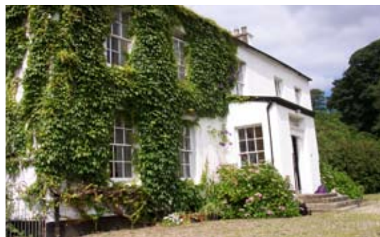
Cavanacor House, Ballindrait, County Donegal. Early 17th century plantation house.

However, more English and Scottish came to Ulster outside the years of official plantation (1610-1625) than were 'planted', especially in the later part of the century. Famine in Scotland in the 1690s saw large numbers immigrating to Ulster. More land became