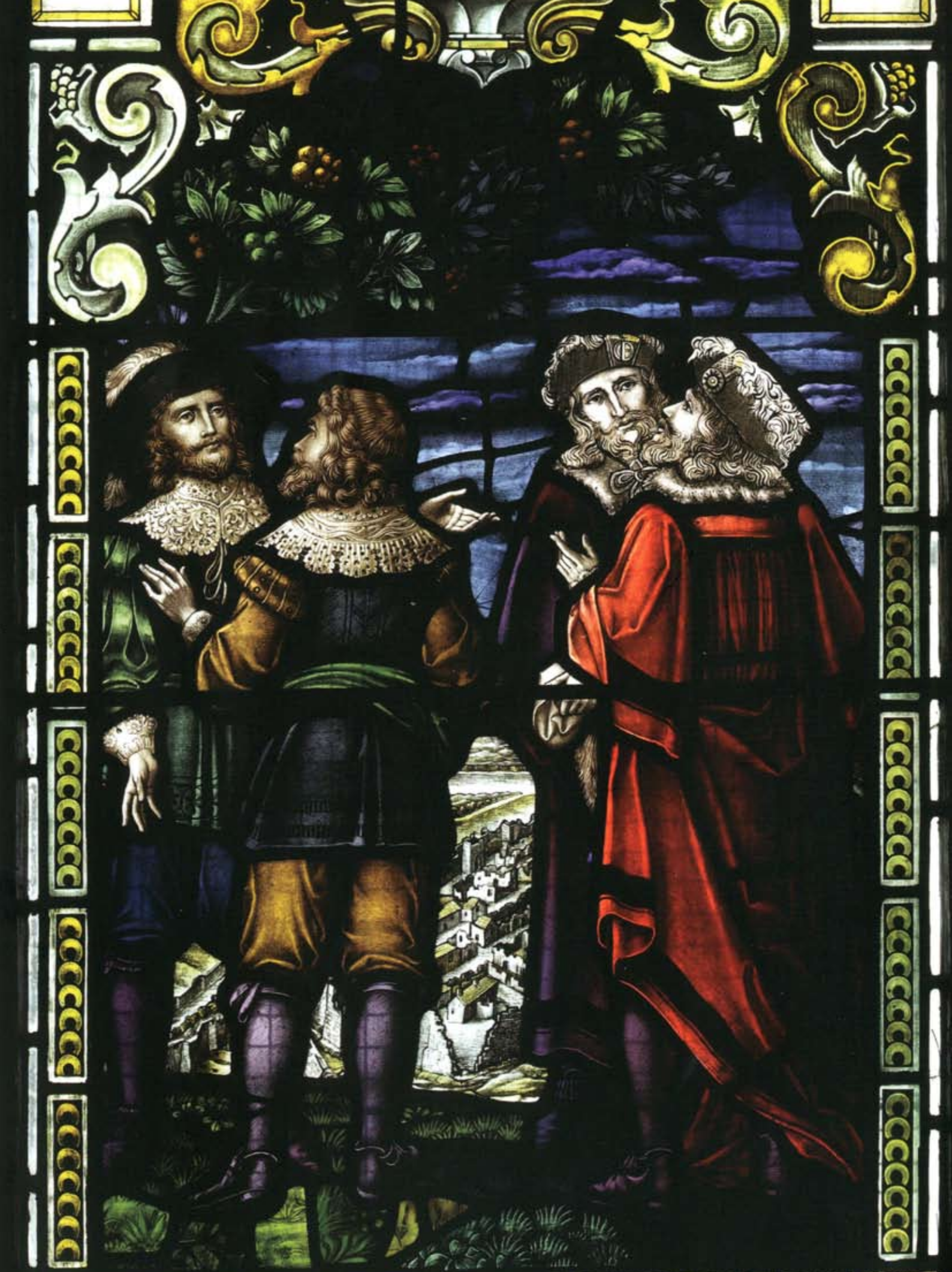
THE FOUR CITIZENS FROM LONDON VIEWING THE SITE OF THE PROPOSED COLONY